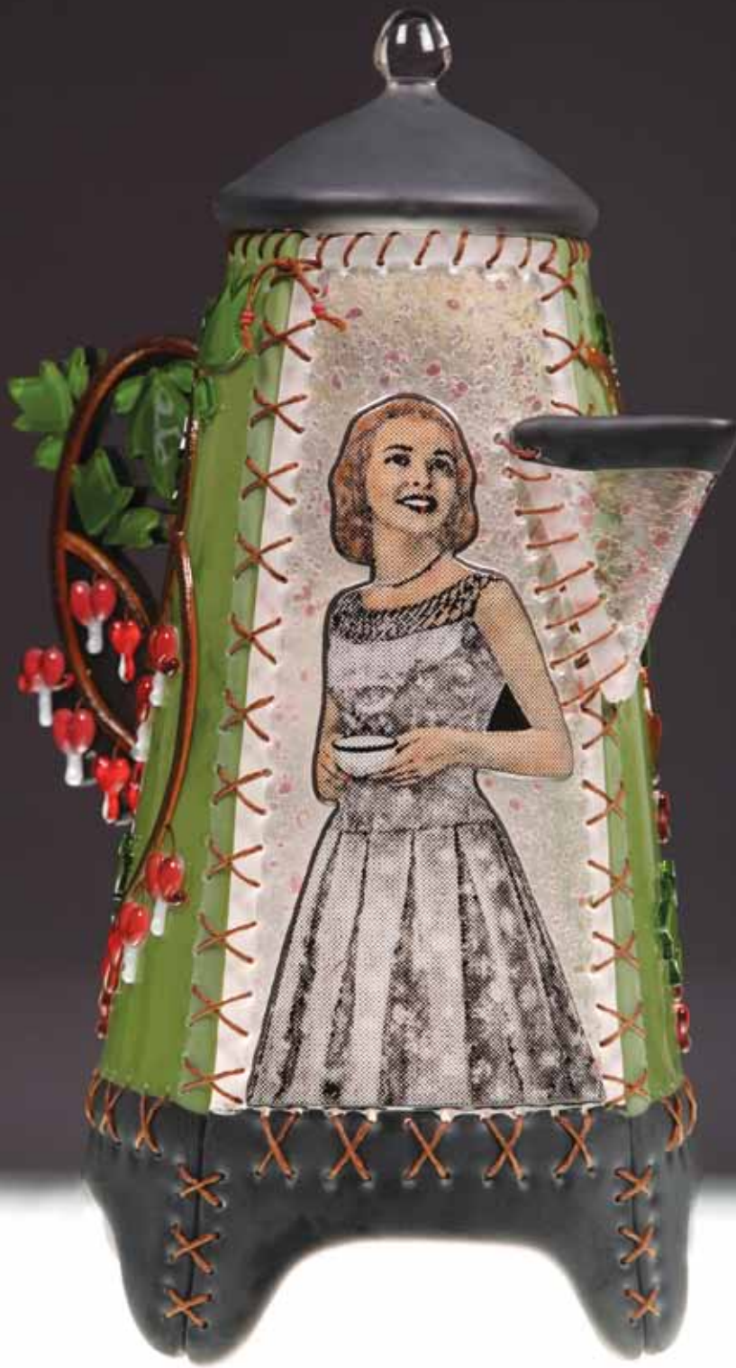
Bleeding Heart, 2008

“Thank you for the Business Edge workshop you did in Columbia. I have to admit, I did not think I would personally come back with so much from the workshop. I’ve been a full-time professional artist for 10 years now and felt that the ‘career planning’ part was over. I was so pleased to learn that career planning is a never-ending opportunity to take stock of “what’s next.” I was also reminded that it’s important to periodically reassess one’s place in the art market and make adjustments. I left the workshop freshly inspired and recharged.”